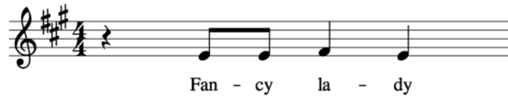
Theme X in “Got to Give It Up”

Theme X refers to another four-note melodic sequence. In the deposit copy, Theme X is sung to the lyrics “Fancy lady.” In “Blurred Lines,” it is first sung to the lyrics “If you can’t hear.” Like the Hook Phrase, Theme X is both unprotectable and objectively dissimilar in the two songs.