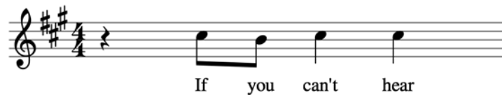
Theme X in “Blurred Lines”